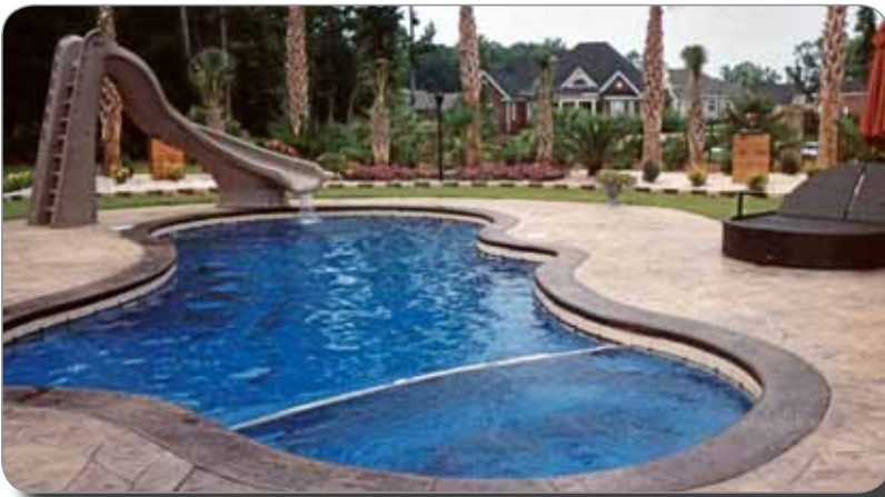
The Pleasure Island pool with the Blue Iridium Finish