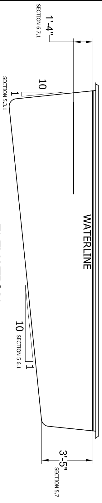
ELEVATION SCALE 1/4" = 1'-0"

AREA: 217 SQ.FT PERIMETER: 60 FT VOLUME: 6000 GAL