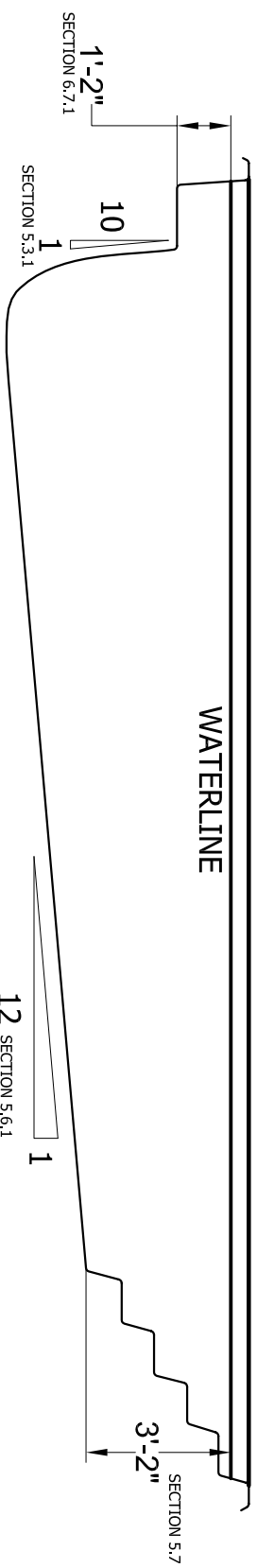
ELEVATION SCALE 1/4" = 1'-0"

AREA: 302 SQ.FT PERIMETER: 70 FT VOLUME: 9500 GAL